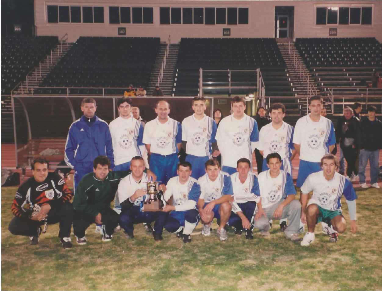
FC Bosnia – 2001 Central Virginia Champions League Champions

FC Bosnia, a CVSA team consisting entirely of Bosnian immigrants, won the inaugural championship, defeating BlackWatch FC of CVSA, which is made up mostly of former local high school and college players, 3-0 at Richmond Sports Backers Stadium on Nov. 21. Two AISL teams and a CASA team also made the final eight.